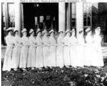
World War II Pearl Harbor Nurse