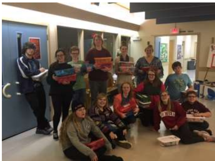
19 Shoe boxes packed for Operation Christmas Child!