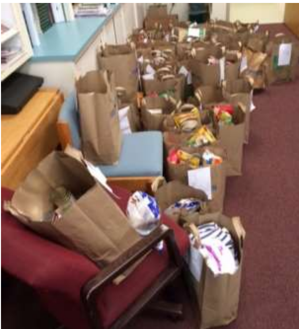
Photo of bags filled with food for the Beach Food Pantry Thanksgiving Project!