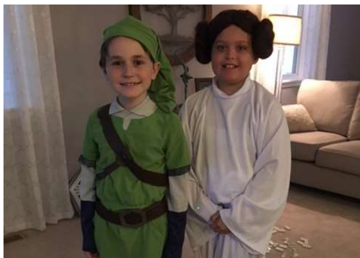
Youth at their annual Costume Party!