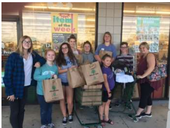
Shopping for Operation Christmas Child!