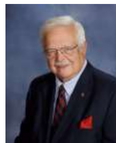
Jim Goes 261-1149